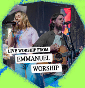
LIVE WORSHIP FROM EMMANUEL WORSHIP

INSPIRING RALLIES OUTDOOR FESTIVAL SOURCE & SUMMIT SACRAMENTS ENGAGING & PRACTICAL WORKSHOPS